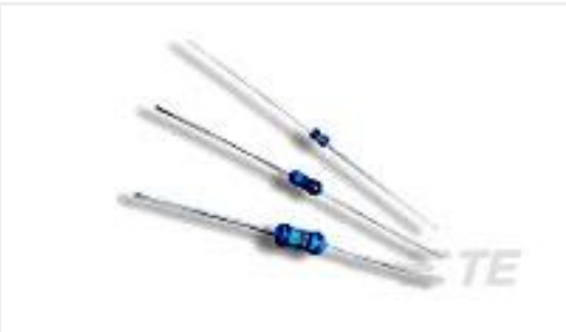
TE Part #1622795-5 YR1 0.1% 4K02