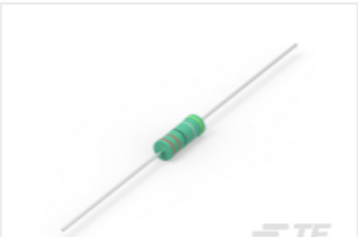
TE Part #1-2176610-7 EP 1W (SS) 4R7 5%