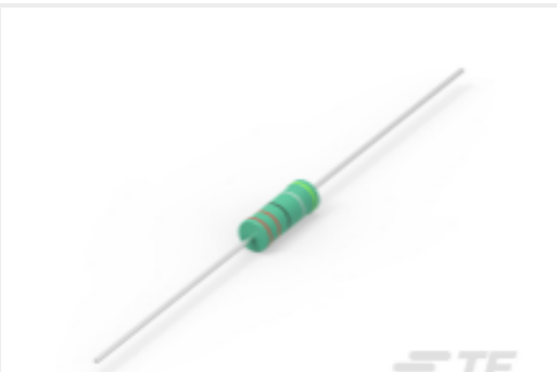
TE Part #1-2176610-9 EP 1W (SS) 5R6 5%