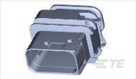
TE Part #1-1564522-1 8POS,TAB 2.8X0.8,TAB HSG,ASSY