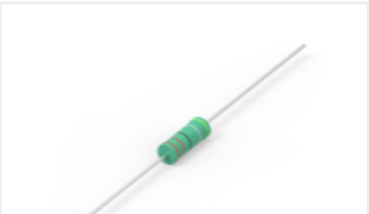
TE Part #1-2176610-3 EP 1W (SS) 3R3 5%