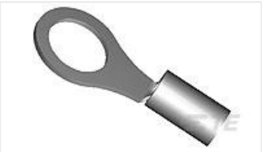
TE Part #322337 DIAMOND GRIP 16-14 HT R 8