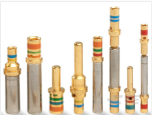
TE Part #ZPF00000000001234 097-0166-12