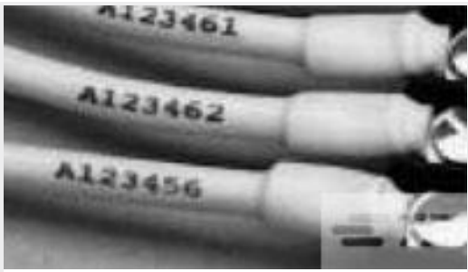
TE Part #5053192058 RNF-100-1/2-0-STK