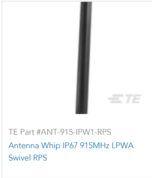
TE Part #ANT-915-IPW1-RPS Antenna Whip IP67 915MHz LPWA Swivel RPS