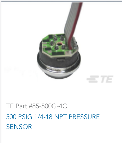
TE Part #85-500G-4C 500 PSIG 1/4-18 NPT PRESSURE SENSOR