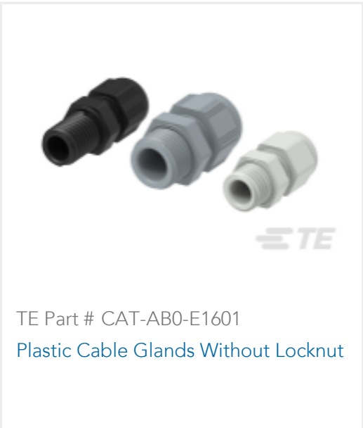
TE Part # CAT-AB0-E1601 Plastic Cable Glands Without Locknut