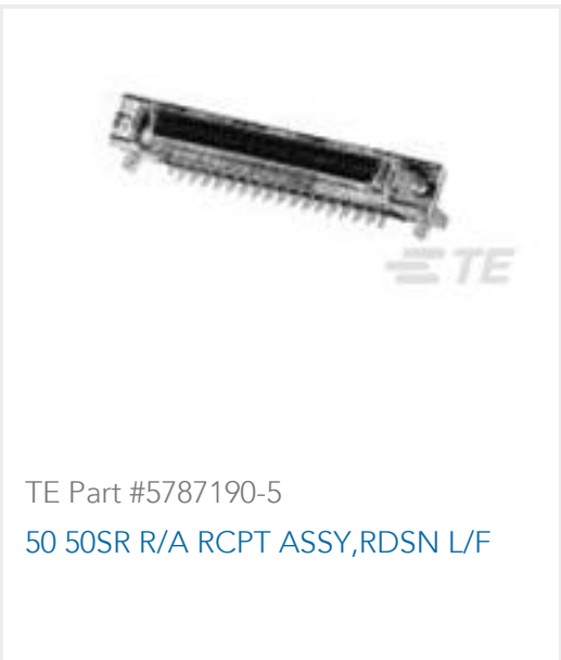
TE Part #5787190-5 50 50SR R/A RCPT ASSY,RDSN L/F