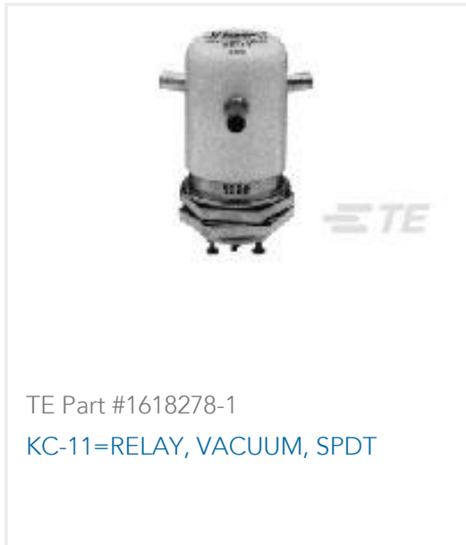
TE Part #1618278-1 KC-11=RELAY, VACUUM, SPDT