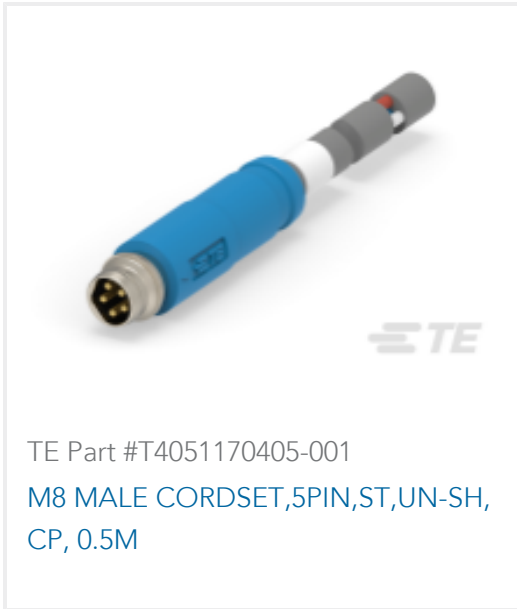
TE Part #T4051170405-001 M8 MALE CORDSET,5PIN,ST,UN-SH, CP, 0.5M