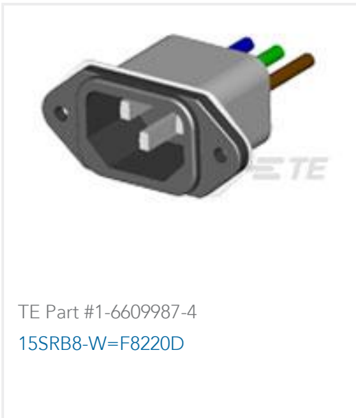
TE Part #1-6609987-4 15SRB8-W=F8220D