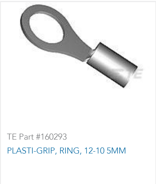
TE Part #160293 PLASTI-GRIP, RING, 12-10 5MM