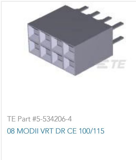
TE Part #5-534206-4 08 MODII VRT DR CE 100/115