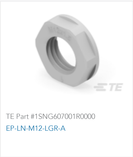
TE Part #1SNG607001R0000 EP-LN-M12-LGR-A