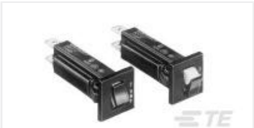
TE Part #2-1393250-5 W28-XQ1A-10=W28-