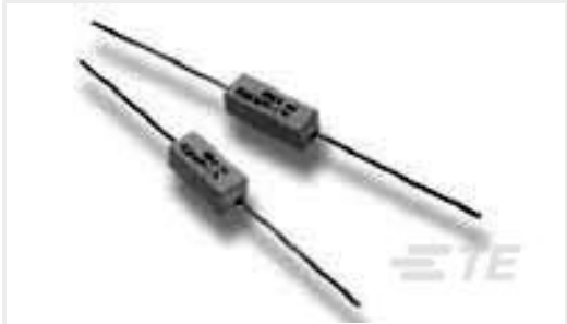
TE Part #1623819-9 SBL4 R022 5%