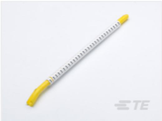
TE Part #CAT-T3437-ST2999 STD Snap-On Markers