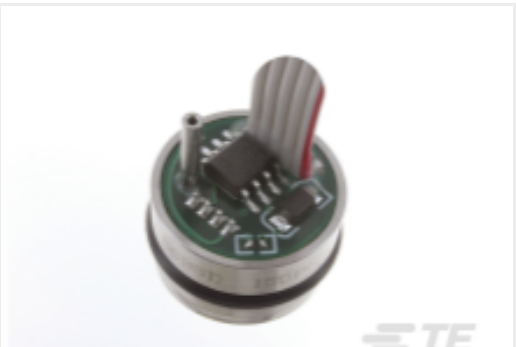
TE Part #86BSD015PG-3AIC 15 PSIG 14 BIT DIGITAL PRESSURE SENSOR