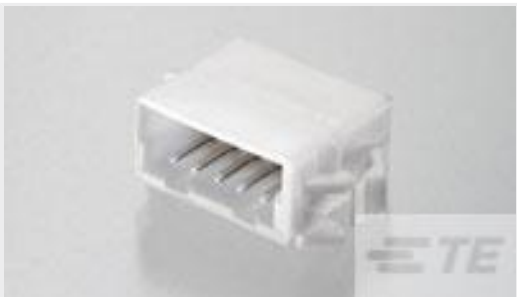
TE Part #1-292254-4 CT RELAY HDR ASSY 14P NAT