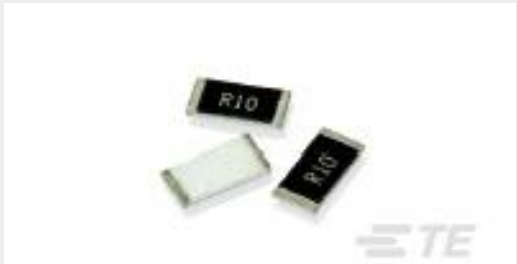
TE Part #2176056-5 RLP73V 2B R015 5% 5K RL