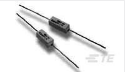
TE Part #1-1623819-2 SBL4 R047 5%