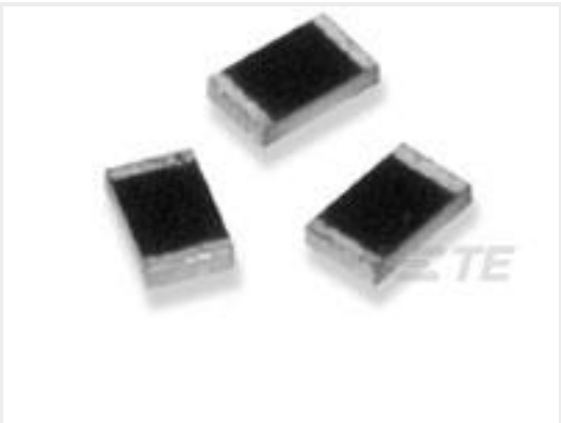
TE Part #6-1879279-4 RP 2A 105K 0.1% 15PPM CUT LENGTH