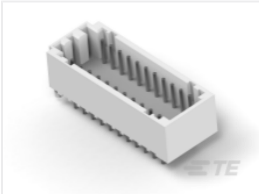
TE Part #CAT-3980700-DRWSV CT 2mm Dbl Row Assembly w/Boss: Vert.