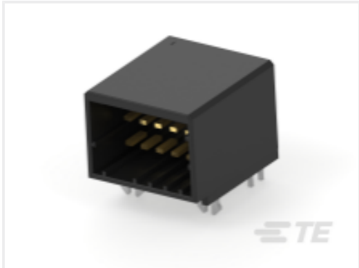
TE Part #CAT-D9934-A66B Header Assembly: Wire-to-Board, 5A, gold plated