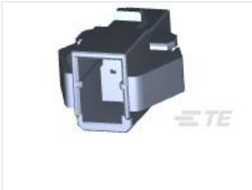
TE Part #1-1903131-2 DYNAMIC 1200D TAB HSG 4P P/M