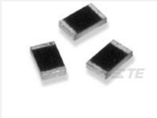
TE Part #9-1879272-7 RP 2A 511R 0.1% 15PPM CUT LENGTH