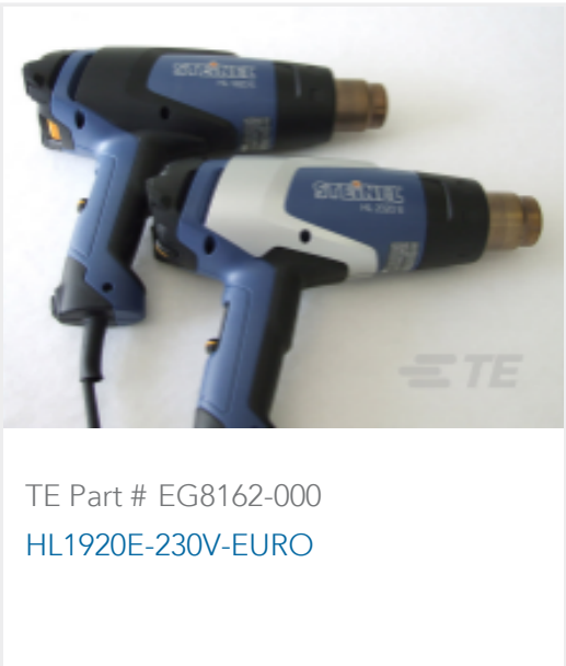
TE Part # EG8162-000 HL1920E-230V-EURO