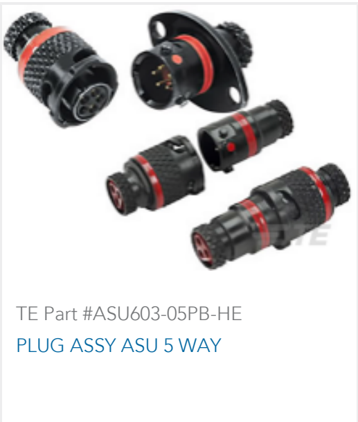
TE Part #ASU603-05PB-HE PLUG ASSY ASU 5 WAY