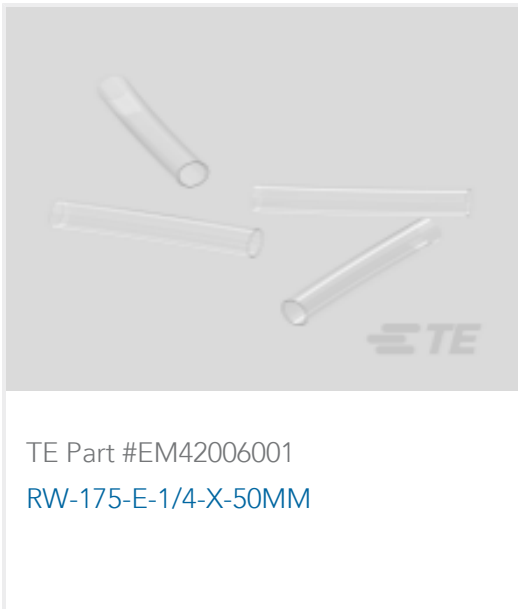
TE Part #EM42006001 RW-175-E-1/4-X-50MM