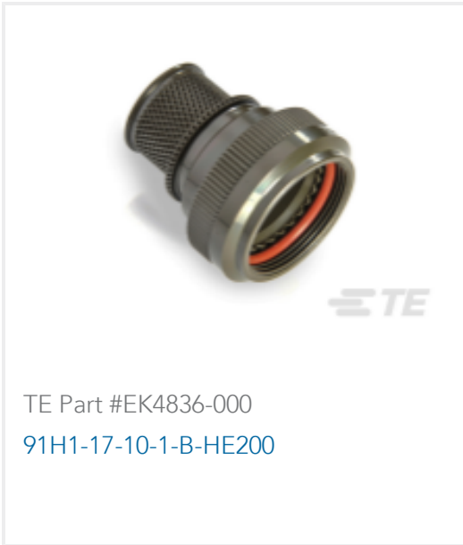
TE Part #EK4836-000 91H1-17-10-1-B-HE200