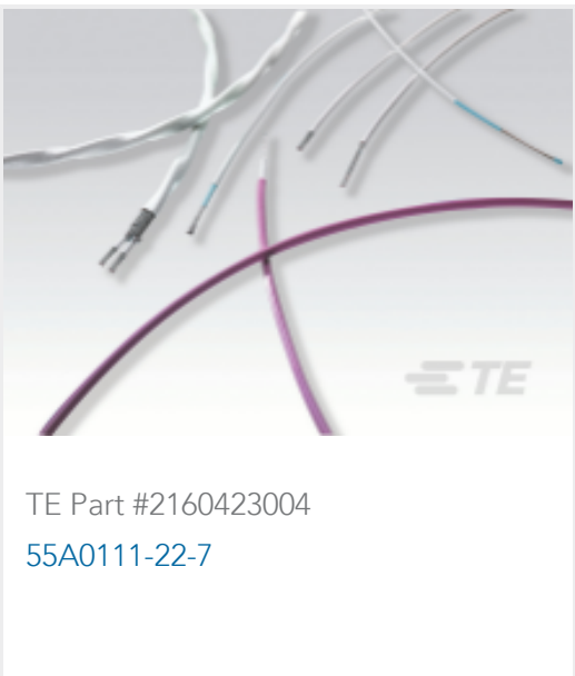
TE Part #2160423004 55A0111-22-7