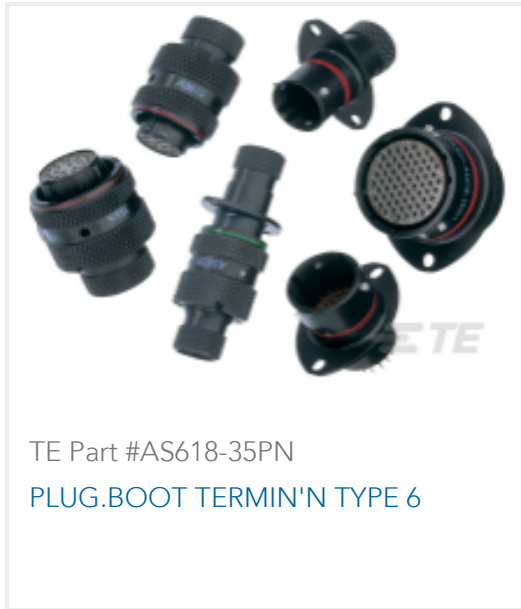
TE Part #AS618-35PN PLUG.Boot TERMIN'N TYPE 6