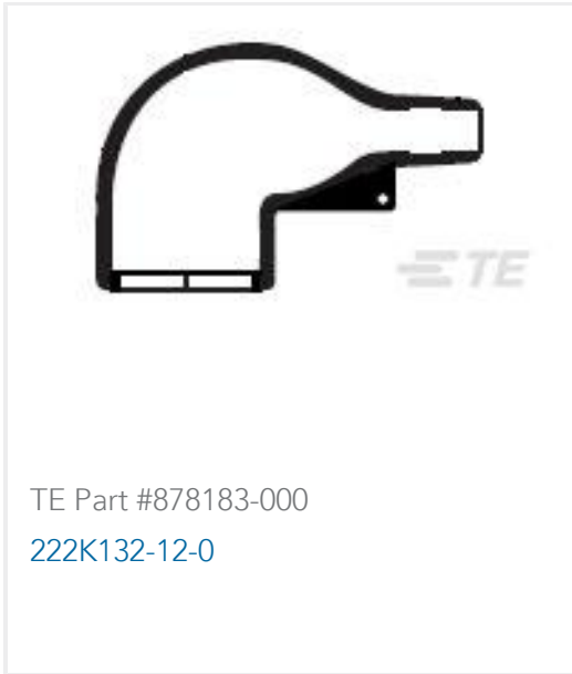
TE Part #878183-000 222K132-12-0