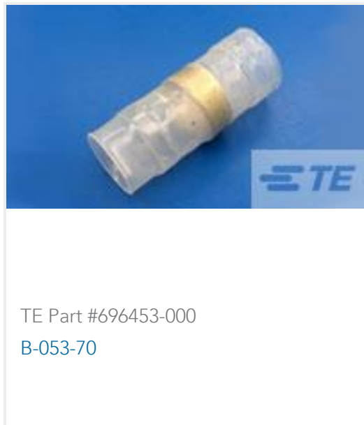
TE Part #696453-000 B-053-70