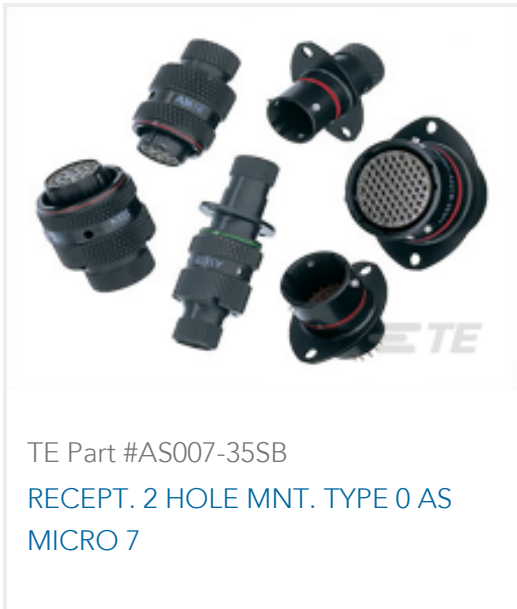
TE Part #AS007-35SB RECEPT. 2 HOLE MNT. TYPE 0 AS MICRO 7