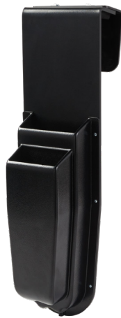
24-15D Double Pocket Tool Holder

Expanded opening accommodates the most common wrenches and drills. Features two spare drill bit holders and adjustable clamp bracket.