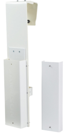
24-18L Fiberglass Chainsaw Scabbard with Removable Liner

Fits standard and hydraulic pistol grip chainsaws. Adjustable clamp bracket. Open bottom fits various bar lengths.