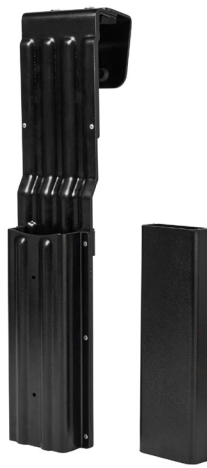
24-14L Chainsaw Scabbard with Removable Liner

Dual handsaw holders for left- or right-hand use. Durable HDPE construction resists blade wear and weather. Open-bottom design fits multiple bar lengths. Z133-2017: 5.2.13 compliant.