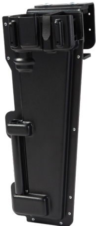
24-12AH Impact Tool Holder With Scabbard

Expanded opening accommodates the most common wrenches and drills. Features two spare drill bit holders and adjustable clamp bracket.