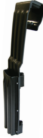
24-14A Chainsaw Scabbard

Fits standard and hydraulic pistol grip chainsaws. Adjustable clamp bracket. Open bottom fits various bar lengths.