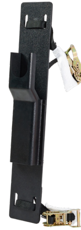
24-03B Long Reach Chainsaw Holder

Inner pocket: 6.25" x 2.25" x 17" Outer pocket: 5.25" x 2.25" x 15" • Thick neck/back for rigidity & strength • Tapered pocket edges for increased strength • Long back or a variety of tools • Drain holes • Ribbed inside pocket base for increased strength when tools are dropped in pockets