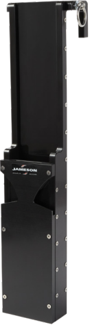
24-19 Chainsaw Scabbard with Handsaw Holder

Jameson Heavy-Duty Bucket Mount Tool Holders provide safe, convenient storage for tools on bucket trucks. Designed to withstand extreme weather, these holders are water-repellent and UV-resistant for long-lasting durability. The adjustable clamp bracket ensures a secure fit on any size bucket—with or without a liner—and can be mounted either inside or outside the bucket for maximum versatility.