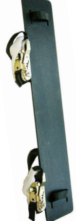
24-14A Chainsaw Scabbard

Fits standard and hydraulic pistol grip chainsaws. Features a replaceable liner that protects scabbard from chainsaw heat and blade. Adjustable clamp bracket.