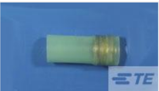
TE Part #427114N001 D-150-1005CS821

Product Drawings CONN SAVER,SZ 3,AMPLIMITE