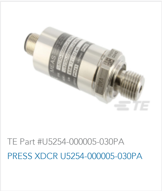
TE Part #U5254-000005-030PA PRESS XDCR U5254-000005-030PA