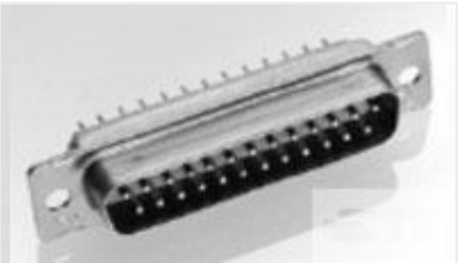
TE Part #206799-2 RECEPT ASSY,15 POSN,AMPLIMITE