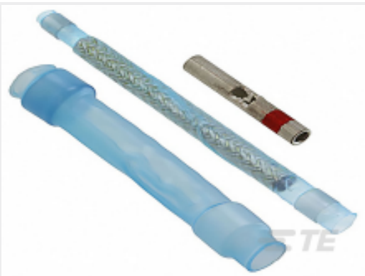
TE Part #233238N001 D-150-1011CS821