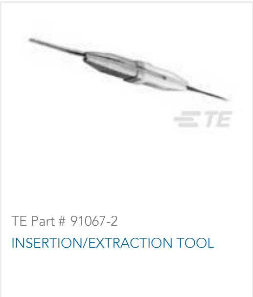
TE Part # 91067-2 INSERTION/EXTRACTION TOOL