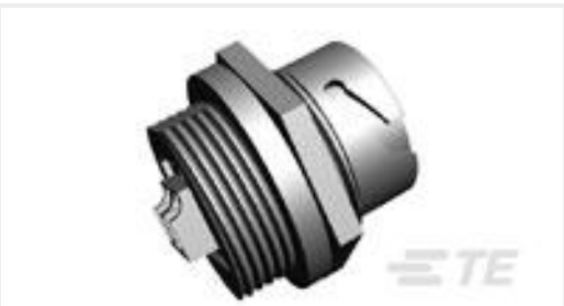
TE Part #1828619-1 Kit,Receptacle,LC, ODVA,MM