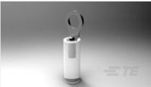
TE Part #329636 TERMINAL,PIDG R 24-20 2