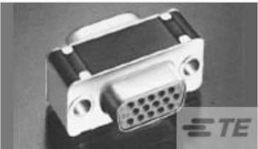
TE Part #212559-2 CONN SAVER, 9 POSN,AMPLIMITE