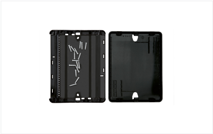
Color: ■ black