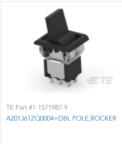
TE Part #1-1571987-9 A201J61ZQ0004=DBL POLE,ROCKER