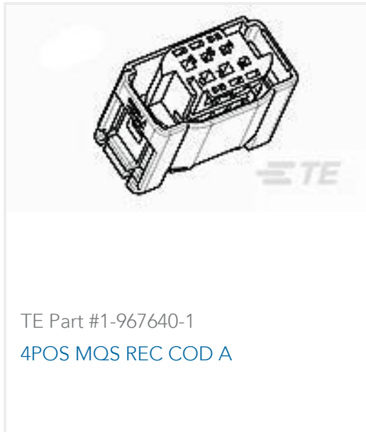
TE Part #1-967640-1 4POS MQS REC COD A