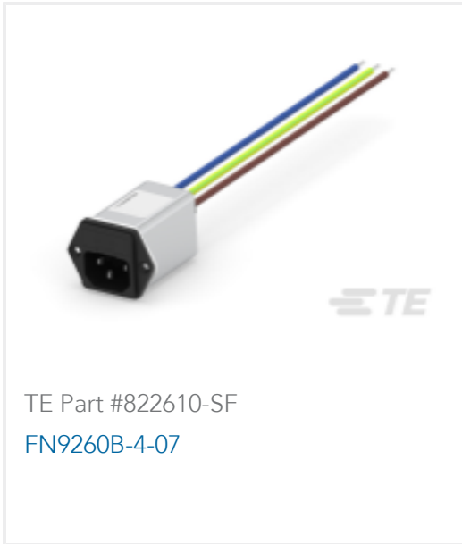
TE Part #822610-SF FN9260B-4-07