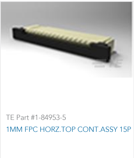
TE Part #1-84953-5 1MM FPC HORZ.TOP CONT.ASSY 15P