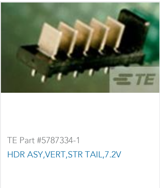
TE Part #5787334-1 HDR ASY,VERT,STR TAIL,7.2V