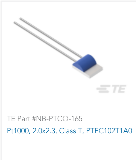
TE Part #NB-PTCO-165 Pt1000, 2.0x2.3, Class T, PTFC102T1A0