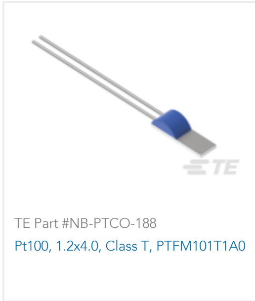
TE Part #NB-PTCO-188 Pt100, 1.2x4.0, Class T, PTFM101T1A0