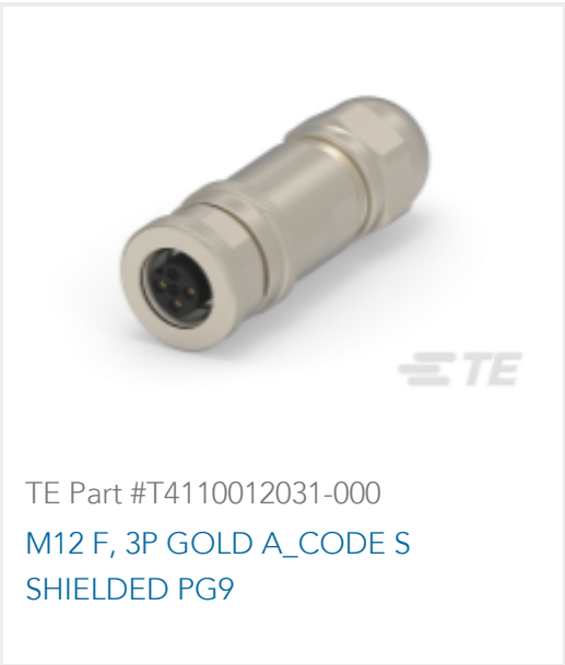
TE Part #T4110012031-000 M12 F, 3P GOLD A_CODE S SHIELDED PG9