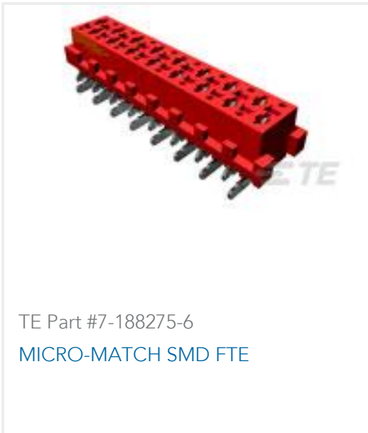
TE Part #7-188275-6 MICRO-MATCH SMD FTE