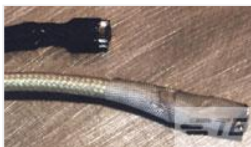
TE Part #7536494002 RT555-1/8-0-SP