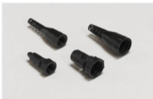
Connector Strain Relief(16)