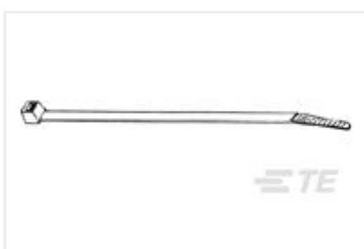
TE Part #1-604771-0 CABLE TIE, 4" BLACK, 100PK