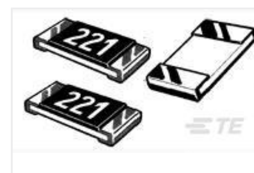
TE Part #5-2176231-6 3522 2K0 1% 3W