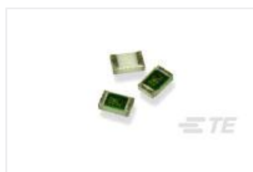
TE Part #4-1614881-3 CPF 0603 20R 0.1% 25PPM 5K RL