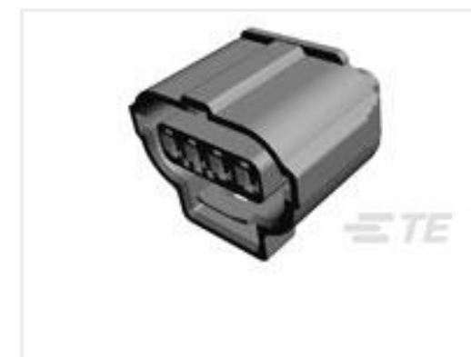
TE Part #184046-1 4 POS. PLUG ASSY, KEY A