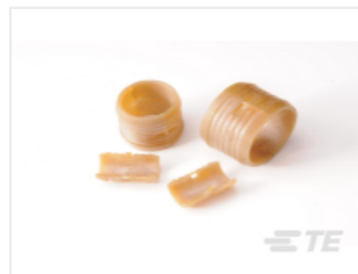
TE Part #AAE3171-00 BND-SR-04