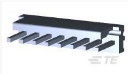
TE Part #3-641208-8 08P MTA156 HDR ASSY FL ST LF