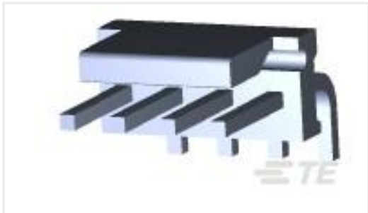
TE Part #3-641210-4 04P MTA156 HDR FLRA FB 30AU LF