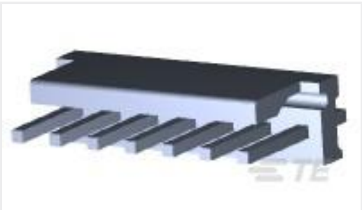
TE Part #3-641208-7 07P MTA156 HDR ASSY FL ST LF