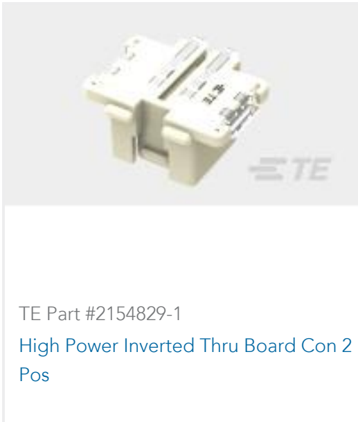
TE Part #2154829-1 High Power Inverted Thru Board Con 2 Pos