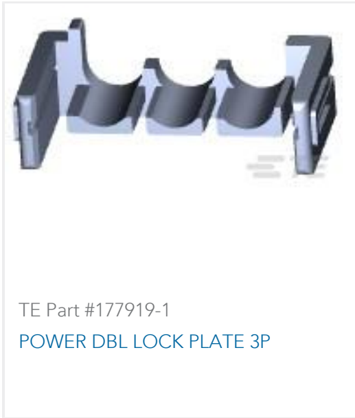
TE Part #177919-1 POWER DBL LOCK PLATE 3P