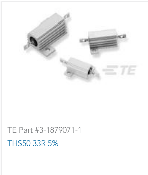
TE Part #3-1879071-1 THS50 33R 5%