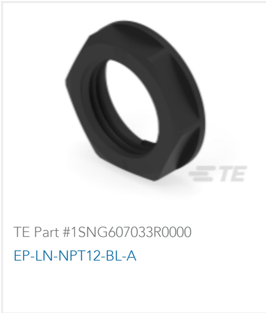
TE Part #1SNG607033R0000 EP-LN-NPT12-BL-A