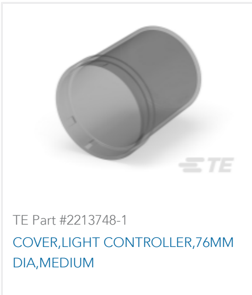
TE Part #2213748-1 COVER,LIGHT CONTROLLER,76MM DIA,MEDIUM