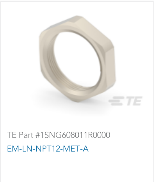
TE Part #1SNG608011R0000 EM-LN-NPT12-MET-A