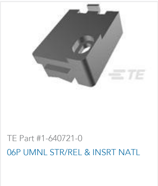
TE Part #1-640721-0 06P UMNL STR/REL & INSRT NATL