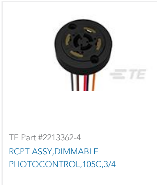
TE Part #2213362-4 RCPT ASSY,DIMMABLE PHOTOCONTROL,105C,3/4