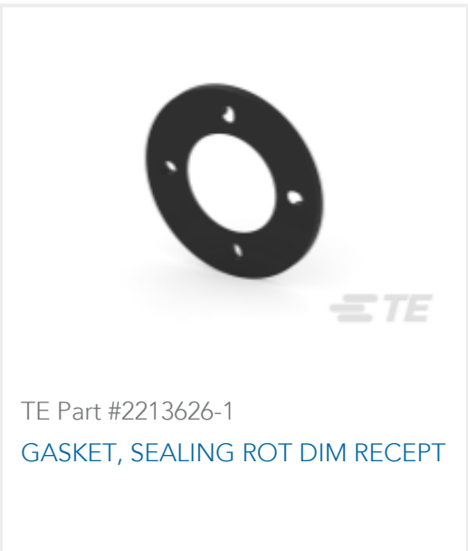
TE Part #2213626-1 GASKET, SEALING ROT DIM RECEPT