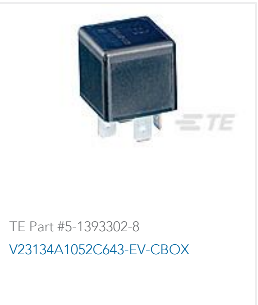
TE Part #5-1393302-8 V23134A1052C643-EV-CBOX