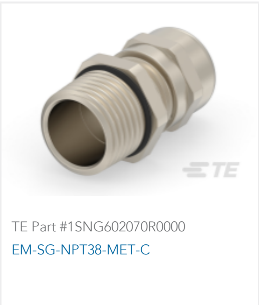
TE Part #1SNG602070R0000 EM-SG-NPT38-MET-C