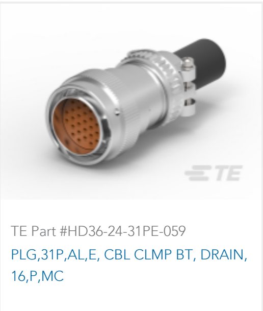
TE Part #HD36-24-31PE-059 PLG,31P,AL,E, CBL CLMP BT, DRAIN, 16,P,MC