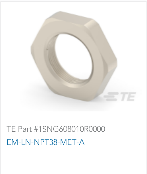
TE Part #1SNG608010R0000 EM-LN-NPT38-MET-A