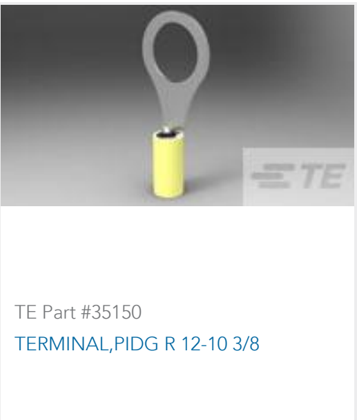
TE Part #35150 TERMINAL,PIDG R 12-10 3/8