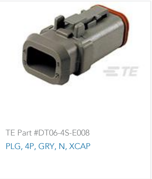
TE Part #DT06-4S-E008 PLG, 4P, GRY, N, XCAP