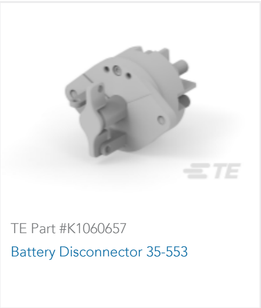
TE Part #K1060657 Battery Disconnecter 35-553