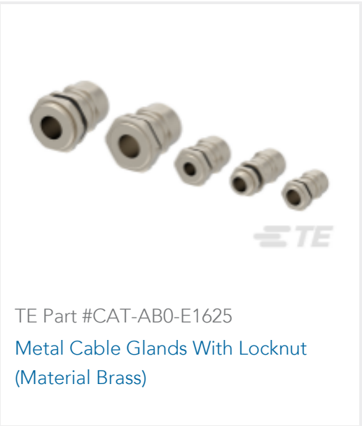
TE Part #CAT-AB0-E1625 Metal Cable Glands With Locknut (Material Brass)