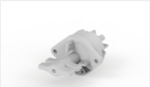
TE Part #K1154427 Battery Disconnecter 35-524-241-R-900