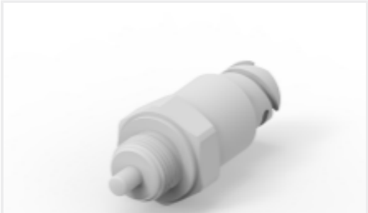
TE Part #K1160758 Plunger Switch 44-01-069