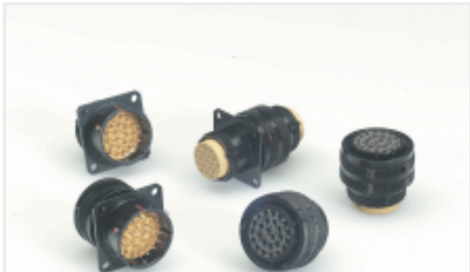
TE Part #ZPF000000000018789 FDBA 50H 8-3A-PN-K