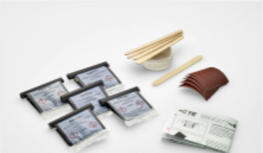
TE Part #931156-000 S1125-KIT-4