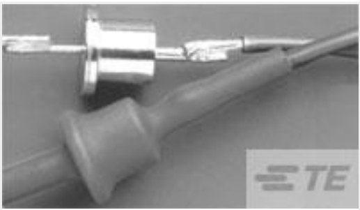
TE Part #5677652002 RNF-3000-9/3-2-STK