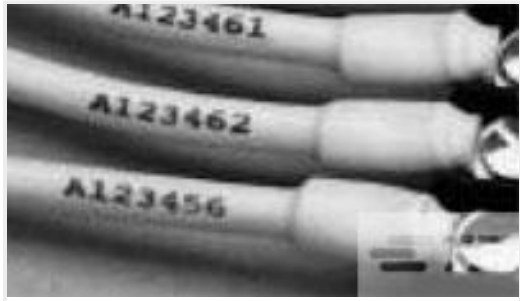
TE Part #5052954017 RNF-100-3/32-2-SP