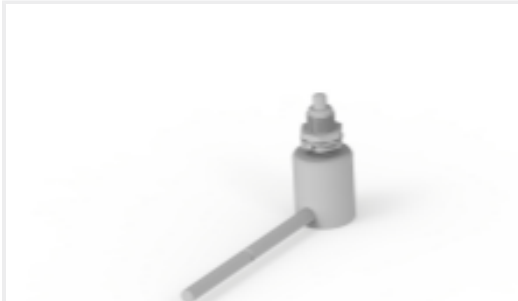
TE Part #K1152919 Limit switch G12-421-M-18