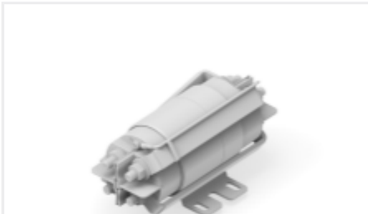
TE Part #K1160973 Power Relay 29-251-11-907