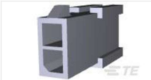
TE Part #794616-2 FREE HANG DBL ROW HSG 2 POS