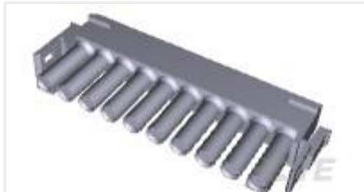
TE Part #926302-1 10& UNIV.M-N-L.PLUG