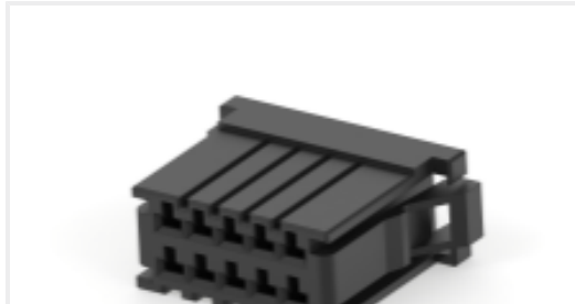
TE Part #CAT-D9934-A75A Receptacle and Tab Housing: 3.81 mm pitch, 250V