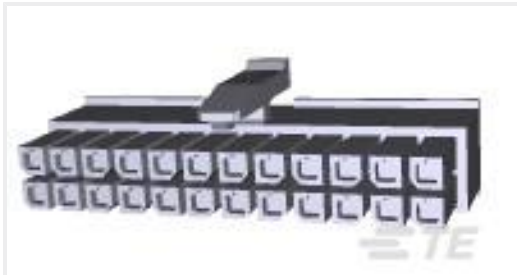
TE Part #2-794617-4 24POS,MICRO MNL,RCPT HSG