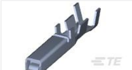
TE Part #175196-2 DYNAMIC D-3 REC CONT. L PdNi & AU 0.38