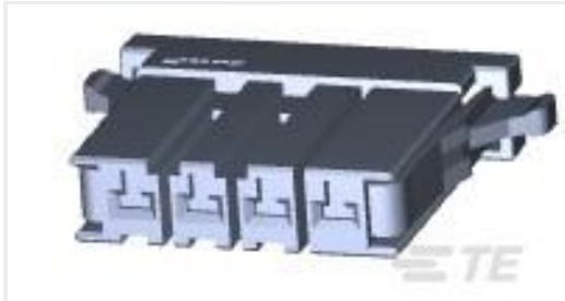
TE Part #1-178128-4 DYNAMIC 3200 REC HSG 4P SGL