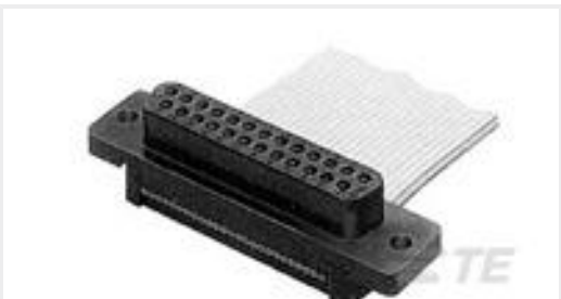
TE Part #1658614-3 15 POS HDF RCPT, AP, LEAD FREE